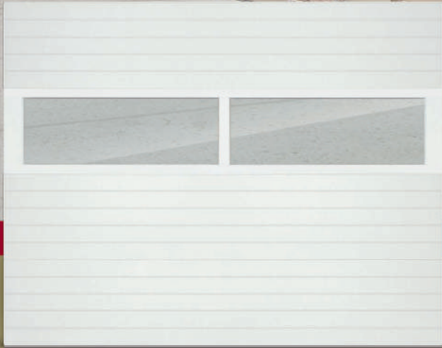
9' x 7' 3285 white with optional white aluminum full-view window section.